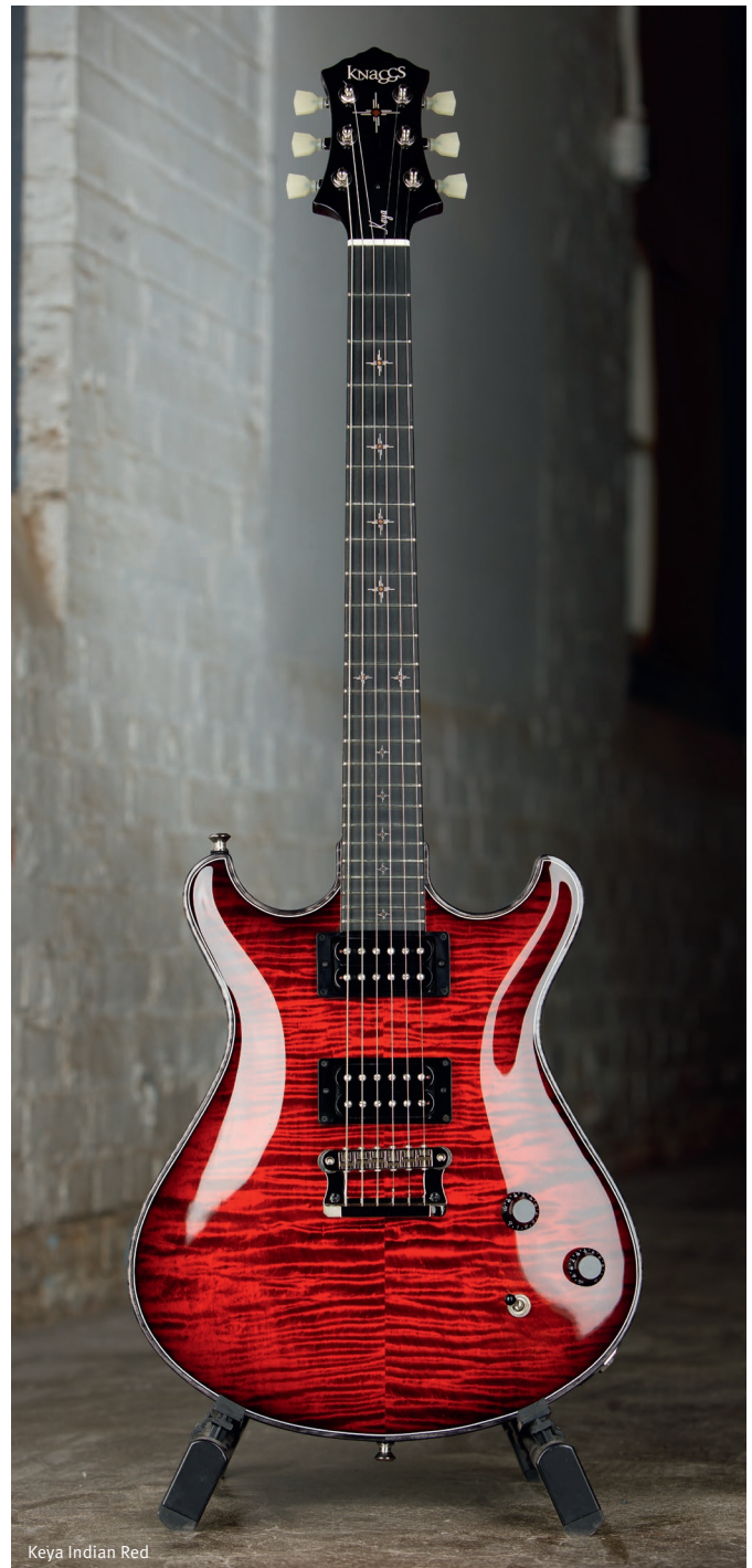
Keya Indian Red

Metallic w/Stripes: Cobra Blue/White Stripes, Candy Apple Red/White Stripes, British Racing Green/White Stripes*