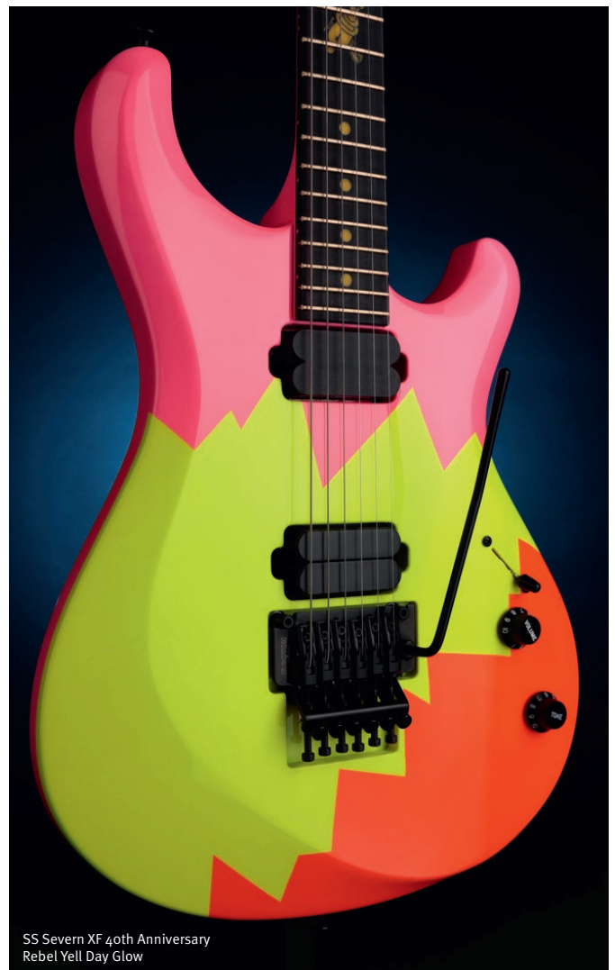
SS Severn XF 40th Anniversary Rebel Yell Day Glow