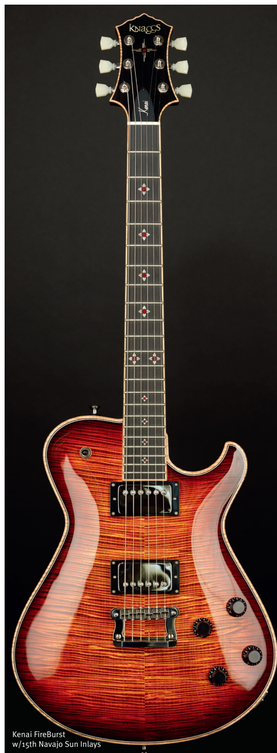
Kenai FireBurst w/15th Navajo Sun Inlays

Available Metallic Finishes: Metallic: Gold Top, Candy Apple Red, Cobra Blue, Pelham Blue, British Racing Green, Pink* Metallic w/Stripes: Cobra Blue/White Stripes, Candy Apple Red/White Stripes, British Racing