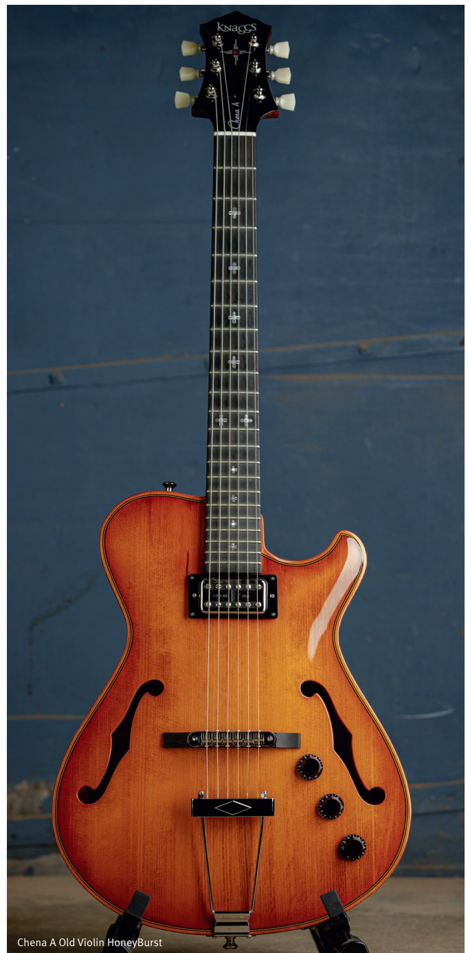
Chena A Old Violin HoneyBurst

Transparent Colors: Black Burst, Burnt Orange Burst, Dark Cherry Burst, Orange, Satin Black Old Violin, Satin Old Violin, Satin Red Old Violin, Tobacco Burst