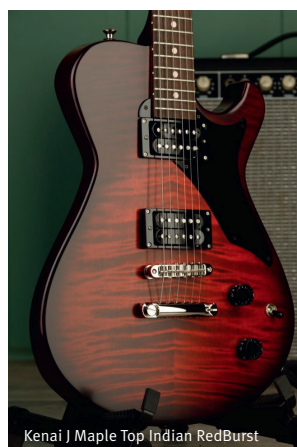
Kenai J Maple Top Indian RedBurst