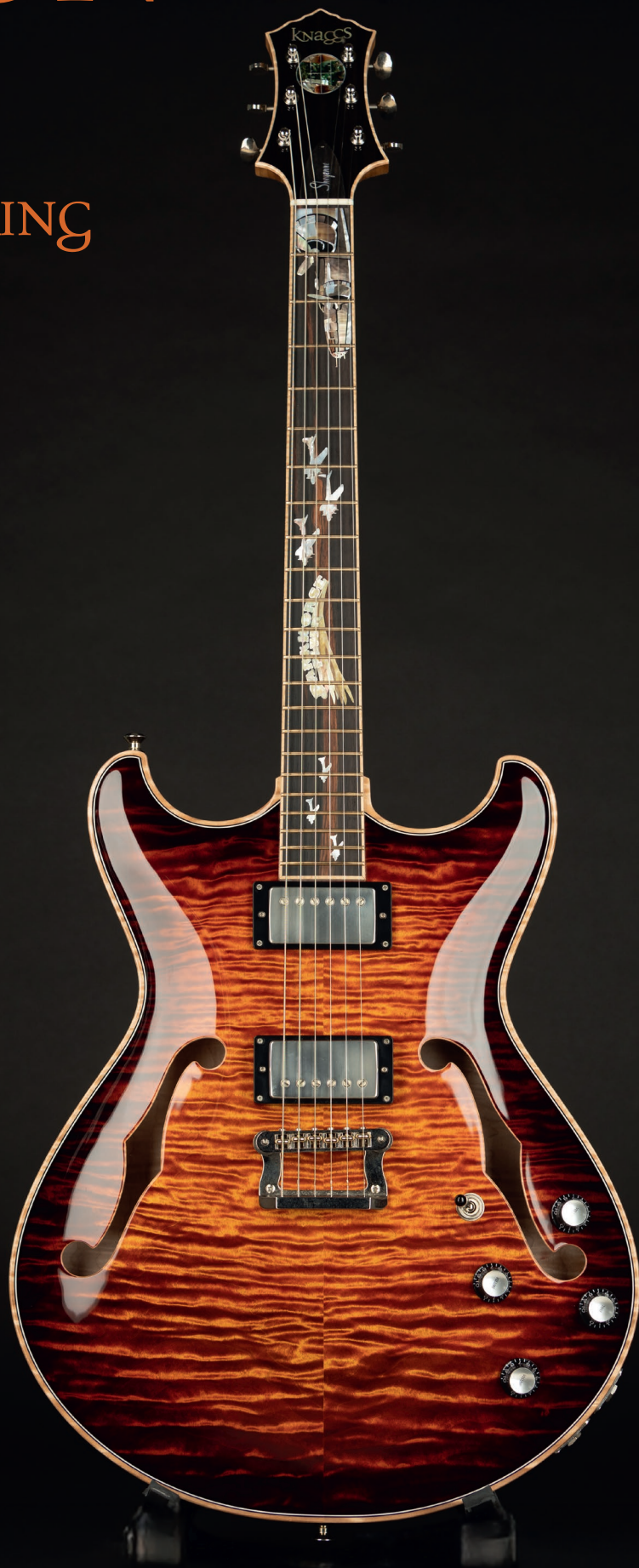
Sheyenne Dark Horse Flyer

These special pieces exist as “one of a kind” never duplicated instruments. As such, they are priced to the dealer as a specific range rather than a fixed price. The customer can specify the concept theme i.e. “Egyptology” as well as model, neck wood, etc but the finished product is seen for the first time upon delivery. Creation Series orders should be discussed preliminarily with an authorized Knaggs representative and ultimately with Joe Knaggs himself.