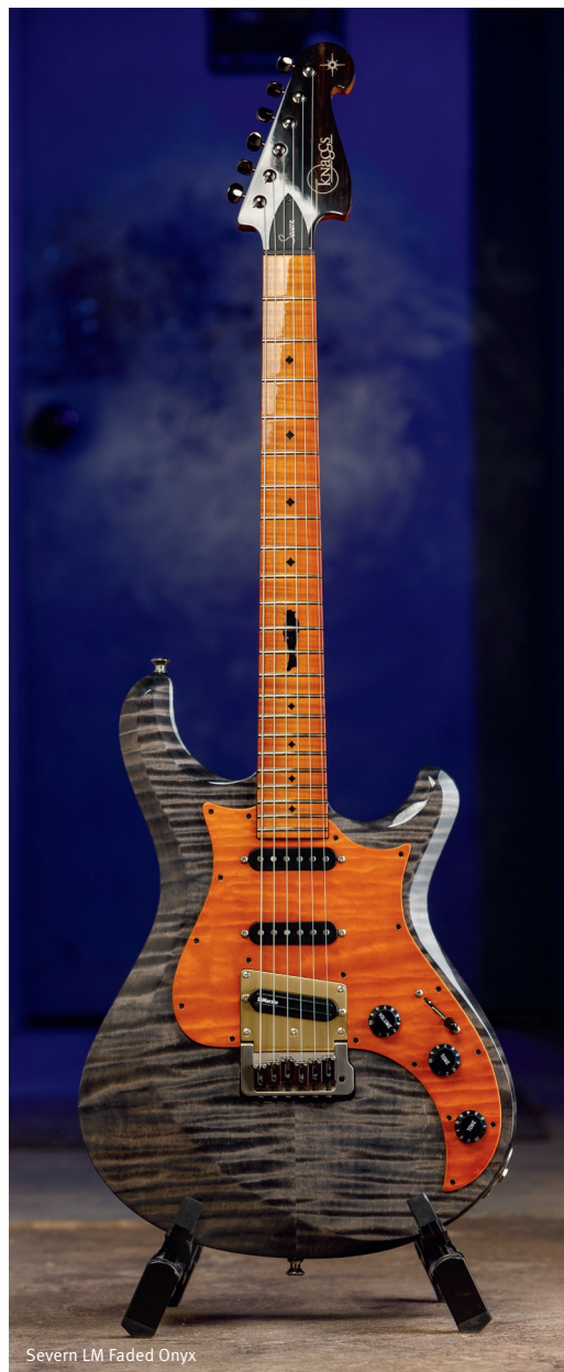
Severn LM Faded Onyx