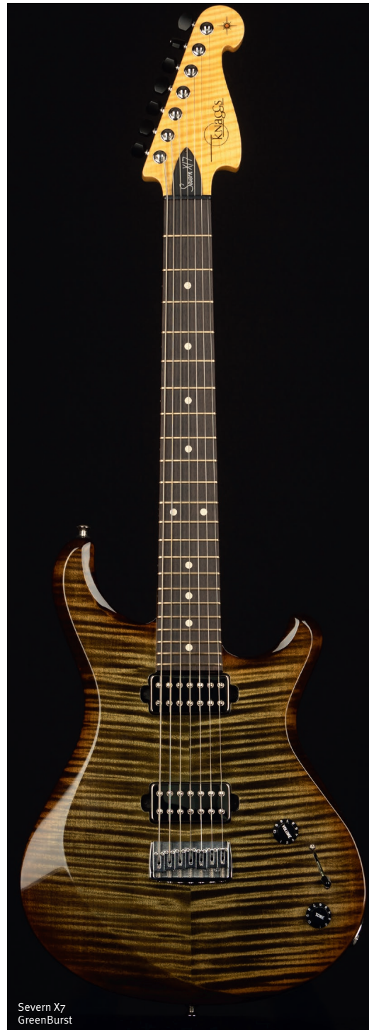
Severn X7 GreenBurst

Available Metallic Finishes: Metallic: Gold Top, Candy Apple Red, Cobra Blue, Pelham Blue, British Racing Green, Pink* Metallic w/Stripes: Cobra Blue/White Stripes, Candy Apple Red/White Stripes, British Racing Green/White Stripes* Sparkle Finishes: Red Sparkle, Blue Sparkle, Silver Sparkle, Gold Sparkle, Green Sparkle, Purple Sparkle*