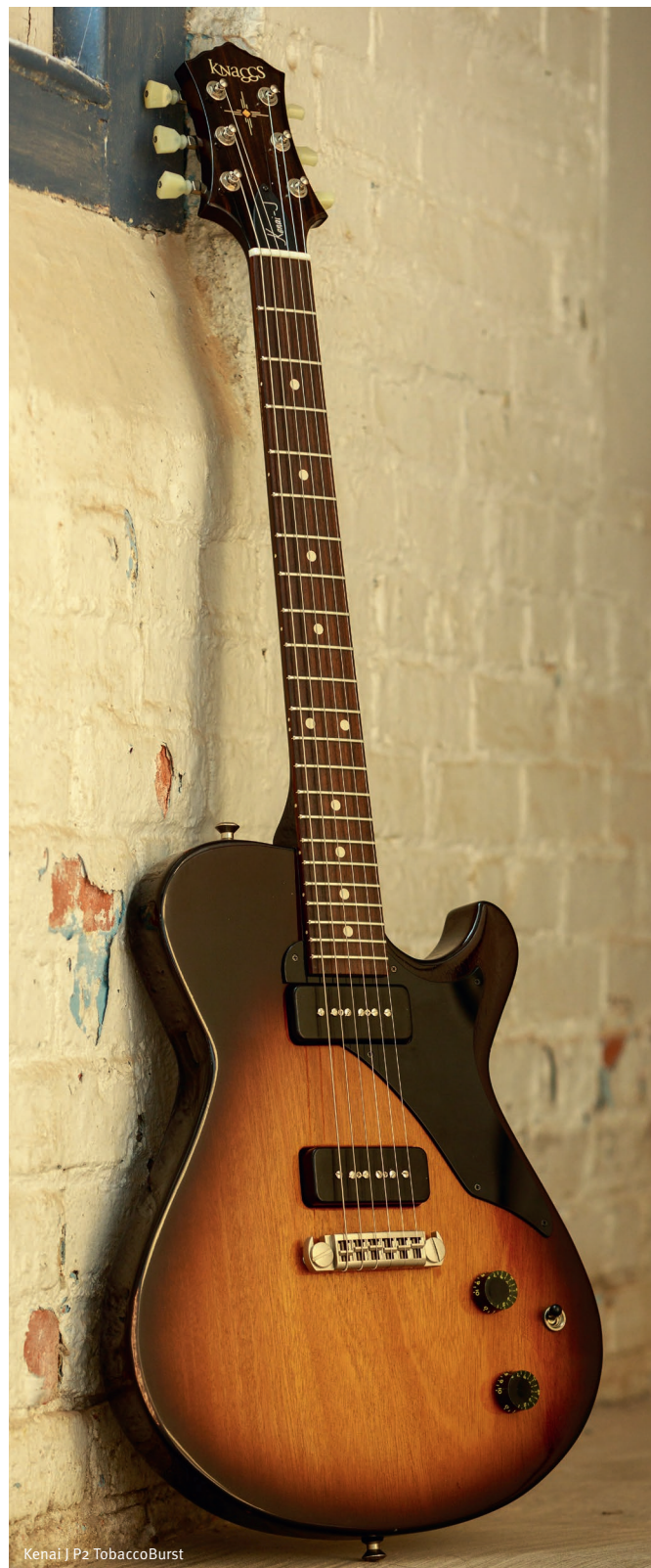
Kenai | P2 TobaccoBurst