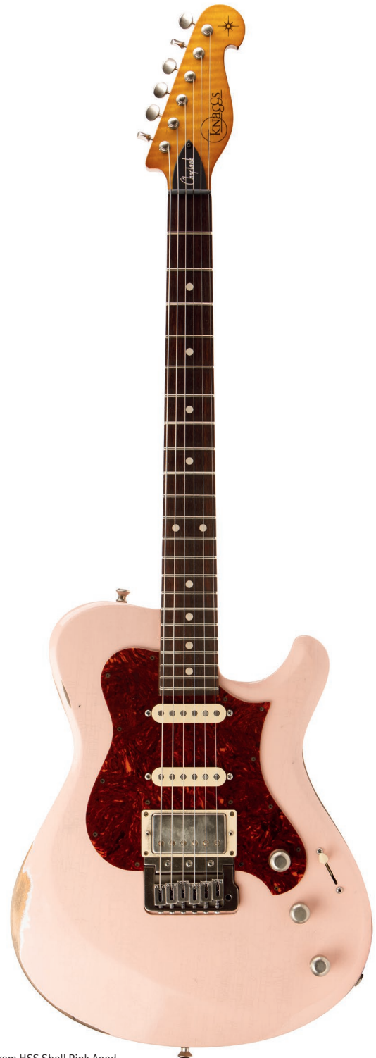
Choptank Trem HSS Shell Pink Aged

Available Metallic Finishes: Metallic: Gold Top, Candy Apple Red, Cobra Blue, Pelham Blue, British Racing Green, Pink* Metallic w/Stripes: Cobra Blue/White Stripes, Candy Apple Red/White Stripes, British Racing Green/White Stripes* Sparkle Finishes: Red Sparkle, Blue Sparkle, Silver Sparkle, Gold Sparkle, Green Sparkle, Purple Sparkle*