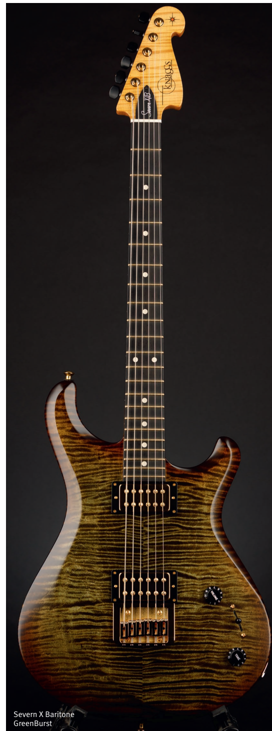
Severn X Baritone GreenBurst

Available Metallic Finishes: Metallic: Gold Top, Candy Apple Red, Cobra Blue, Pelham Blue, British Racing Green, Pink* Metallic w/Stripes: Cobra Blue/White Stripes, Candy Apple Red/White Stripes, British Racing Green/White Stripes*