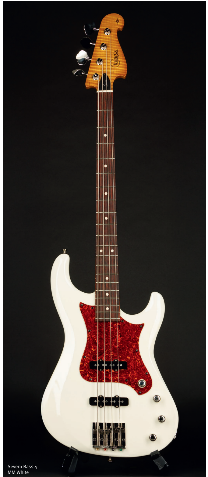
Severn Bass 4 MM White

Available Metallic Finishes: Metallic: Gold Top, Candy Apple Red, Cobra Blue, Pelham Blue, British Racing Green, Pink* Metallic w/Stripes: Cobra Blue/White Stripes, Candy Apple Red/White Stripes, British Racing Green/White Stripes* Sparkle Finishes: Red Sparkle, Blue Sparkle, Silver