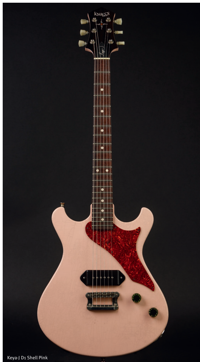
Keya-J D1 Shell Pink