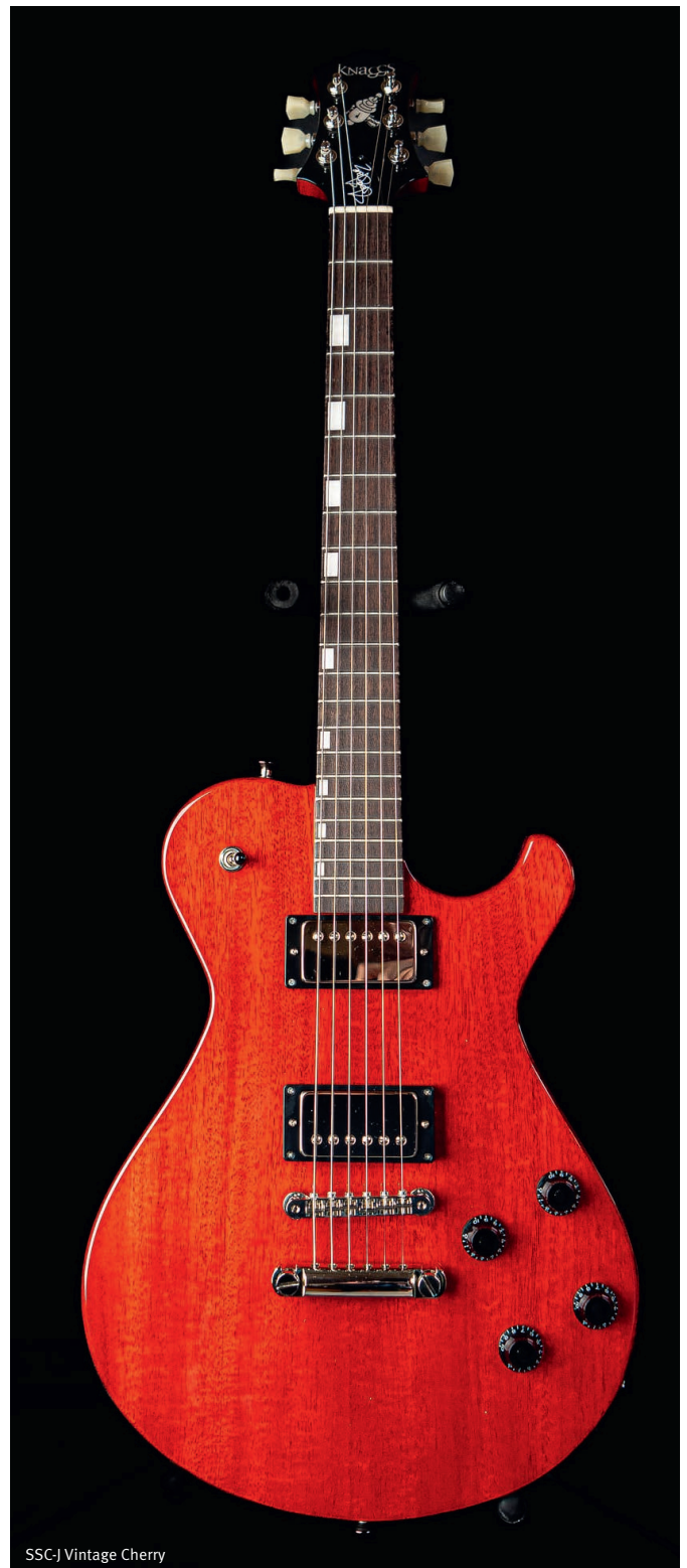
SSC-J Vintage Cherry