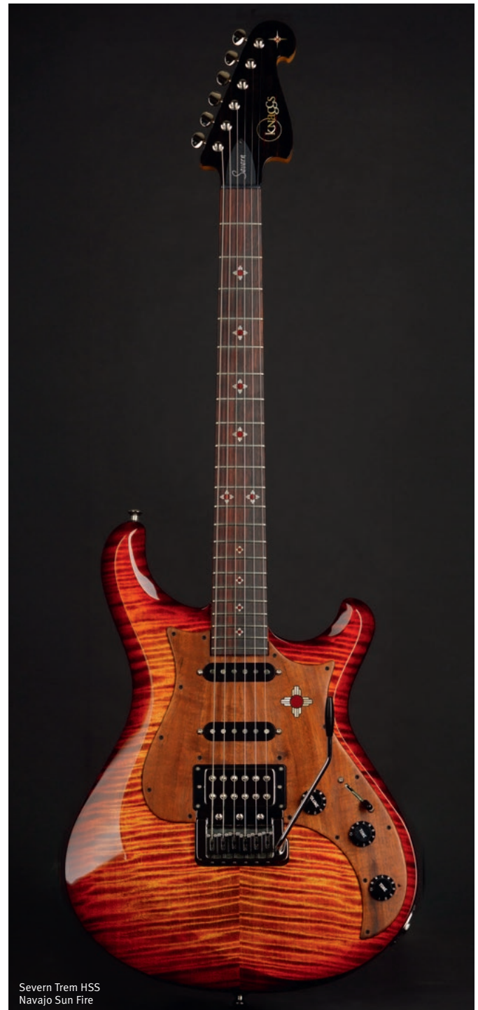
Severn Trem HSS Navajo Sun Fire

Candy Apple Red/White Stripes, British Racing Green/White Stripes* Sparkle Finishes: Red Sparkle, Blue Sparkle, Silver Sparkle, Gold Sparkle, Green Sparkle, Purple Sparkle*