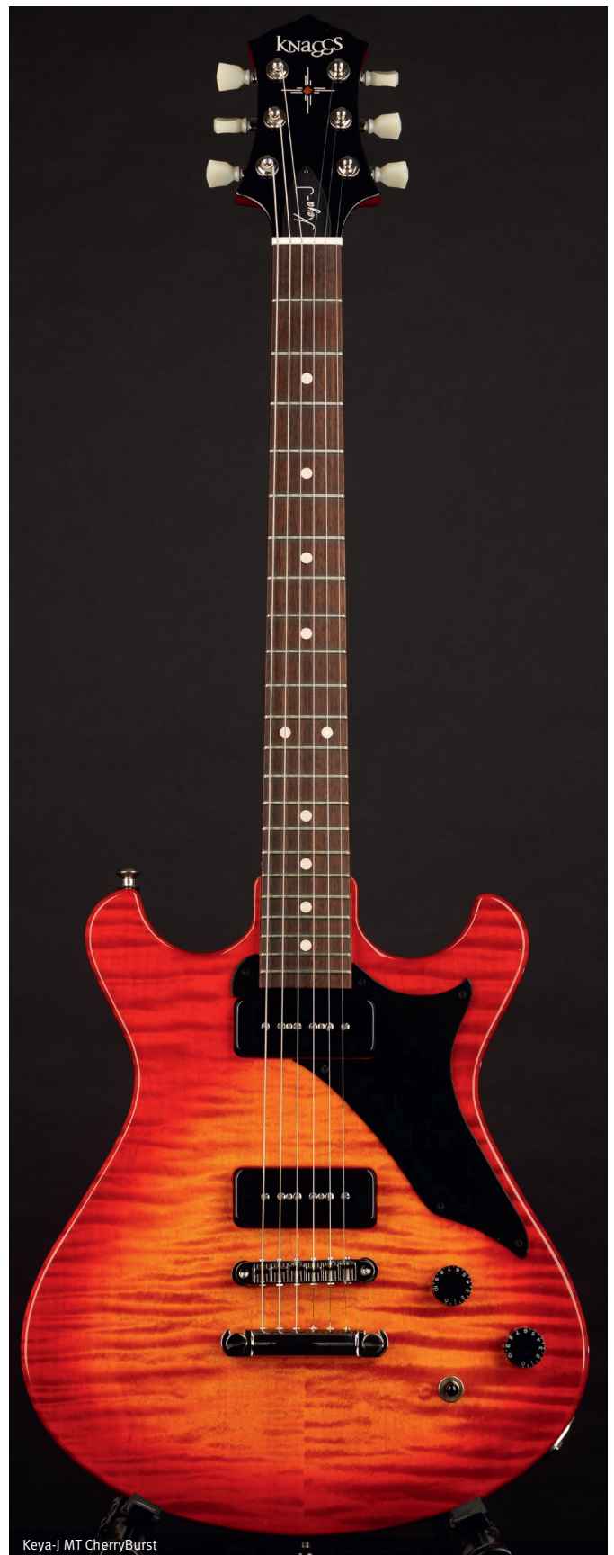
Keya-J MT CherryBurst