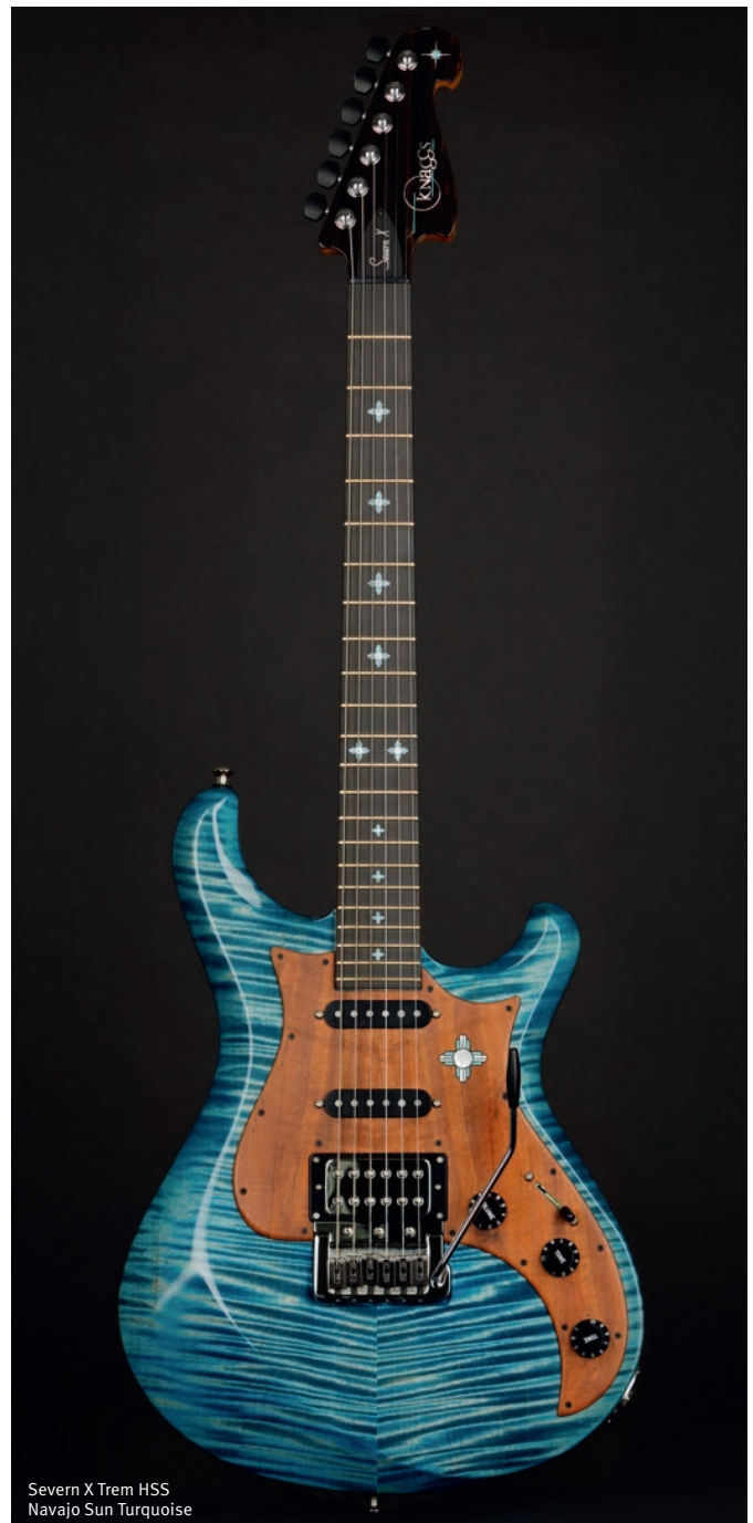
Severn X Trem HSS Navajo Sun Turquoise

Sparkle, Gold Sparkle, Green Sparkle, Purple Sparkle*